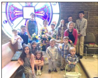
The Sunday School and Youth Church children participate in "flowering" our altar and the cross on Easter Sunday. Pictured right are the all the children who participated in this event.