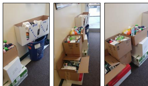
Boxes of supplies for Health Right's showering program - SHINE - collected during Lent by our parish.