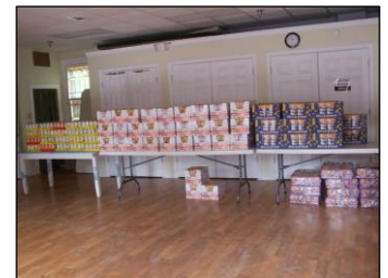
Top right: Some of the food SRSB sends home as part of the Backpack Feeding Program.

The filled bags contain a can of Spaghetti O's, two packages of Ramen noodles, a box of macaroni and cheese, and packets for hot and cold cereals. Also included, of course, are a fruit cup and two snacks. Sometimes a service organization donates raisins, apples, and carrots to supplement the children's meals.