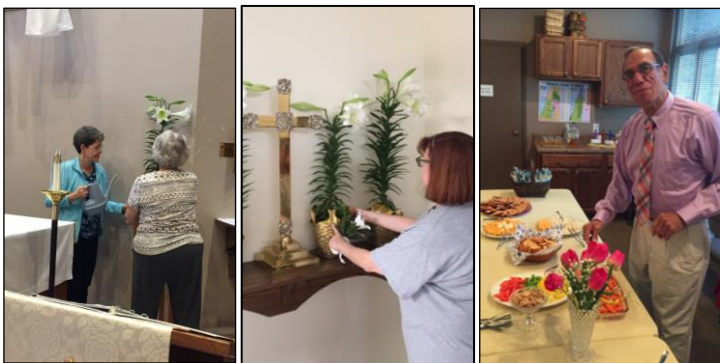
(Above) Members of the Altar and Flower guilds as well as the Fellowship Committee set up for Easter. (Below) Children hunt for eggs. Parishioners enjoy coffee hour.

The children flowered the cross during the 10:30 a.m. service. Fellowship hosted coffee hour after the 8 and 10:30 a.m. services.